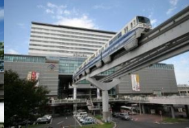
JR Kokura Station