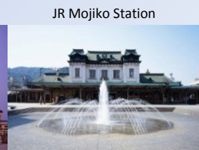
JR Mojiko Station